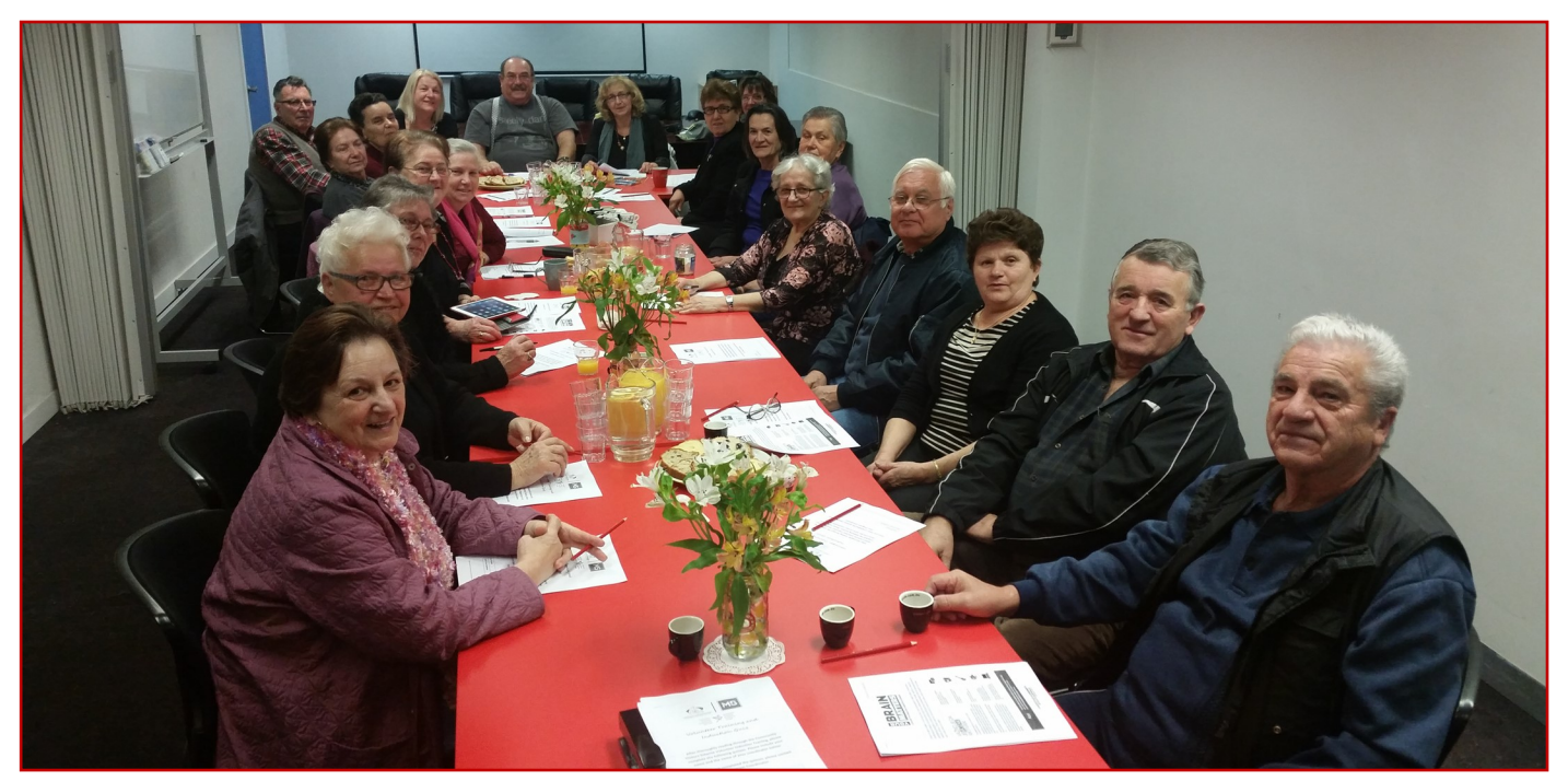
Volunteers North West