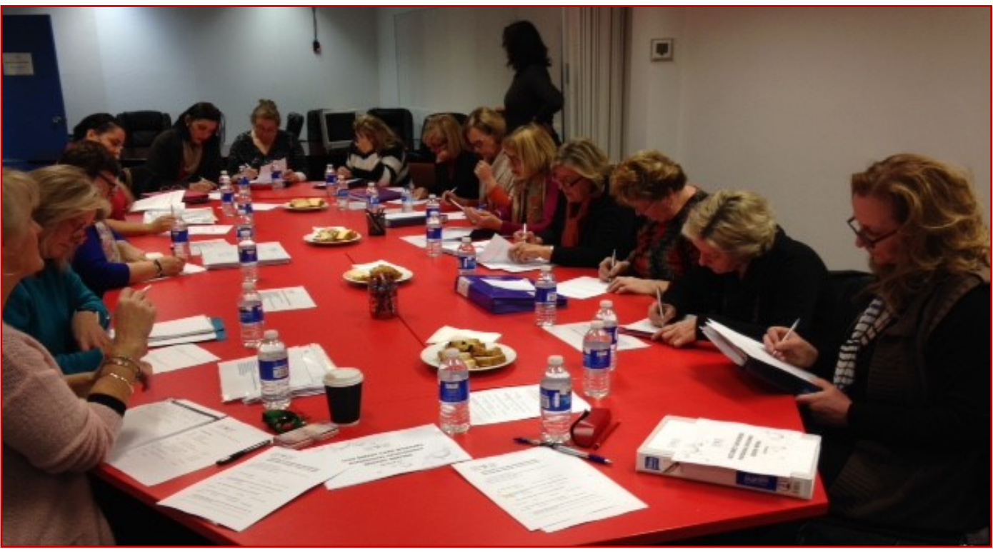
Brokerage and Home Care Packages DCWs Staff Meeting (Footscray Office)